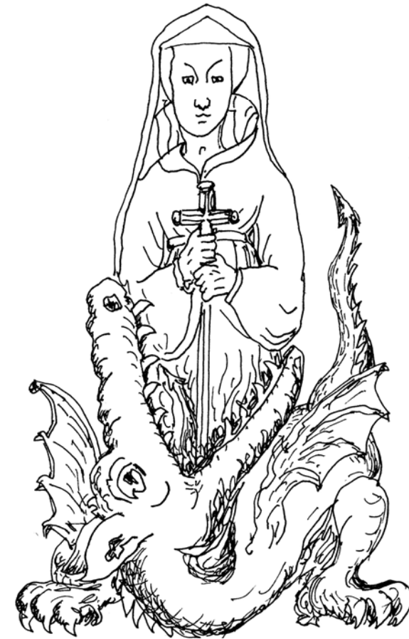
St Margaret from a 14th century carving