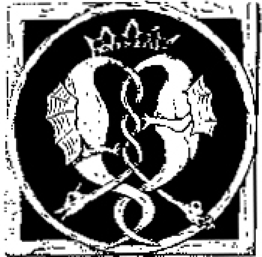
Flint Flushwork Dragons making the letter M, from Ixworth St Mary, Suffolk