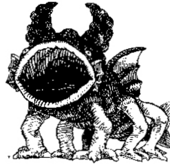
BUKAVAC /ROARER/ HURLEUR