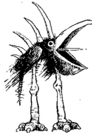
CIKAVAC /SCREECHER/ PIAILLEUR

Every vampire is inhabited by one or more vampire-moths who may leave their host by the way of the mouth. When killing a vampire you must be certain to kill the moth as well, for if he escapes he may continue to do evil to the living.