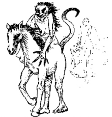
TODORCI /THE BAD FRIDAY RIDERS/ CENTAURES DE LA NUIT

A winged animal with a long beak and a baggy throat. It is hatched from an egg that is been kept under the armpit for forty days. It fulfills its master's every desire and gives him knowledge of the secret language of Nature.