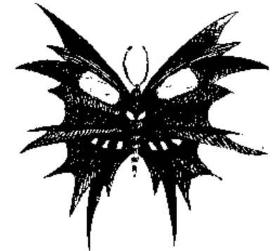
VAMPIRIĆ /VAMPIRE MOTH/ VAMPIRET

A monster with six legs and gnarly horns. Lives in lakes and large marshes. During the night he comes noisily out of the water, jumps on people and animals and strangles them.