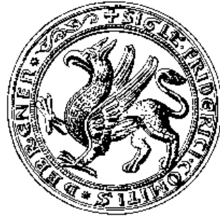
Seal of Graf Friedrich von Brene, 1208