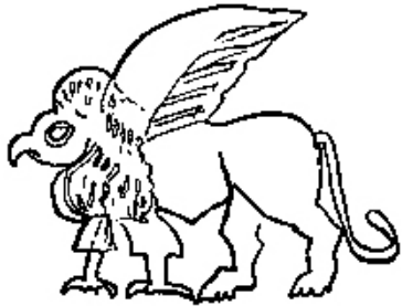
From an old Persian cylinder seal, 3000 BC.

Next Vernon sent a little gem he found in a second-hand bookshop, a German printing-house calendar for the year 1939, which is dedicated to the Griffin:- DER GREIF Eine Geschichte des Buchdrucker-Wappentieres mit einem Kalender auf das Jahr 1939 , by Konrad Bauer (Frankfurt am Main, 1938). It has chapters on the natural history of the Griffin from earliest times, its deeper meaning, its use in heraldry, and its adoption as a special mark of the printers' trade, all copiously illustrated. Here is a little selection as a taster (and see also No 53, page 6, for a modern version).